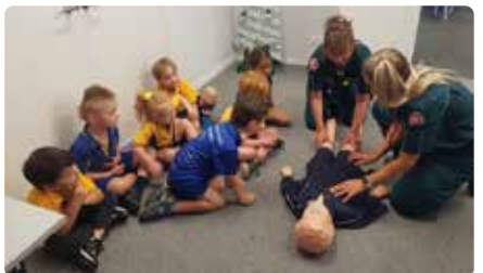
Shark Bay St John Ambulance crew